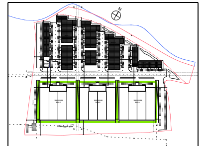
Site Key Plan